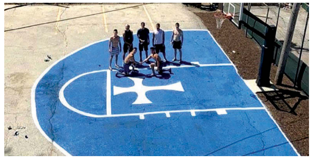
For many years, the Kappa Kappa Chapter's basketball court had faded paint. This year, the week in-house brothers moved in, some decided it was time for a tune-up, so they gave the parking lot court a new coat of paint and made it look very slick.