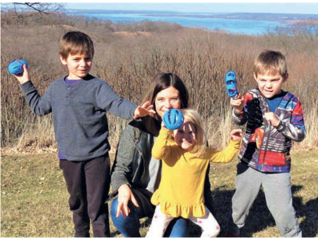
Family Bandit Ball photo shoot.

Well, it's somewhat cliché, but I'd have to